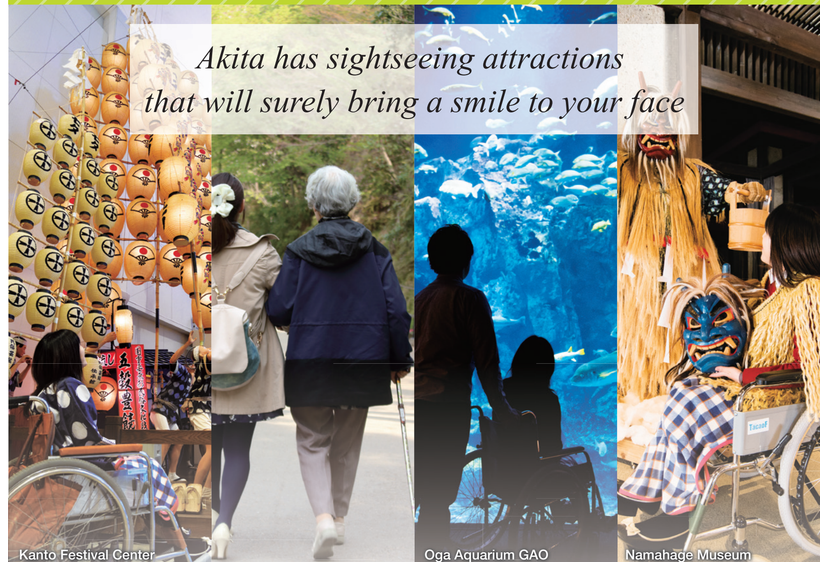
Kanto Festival Center

Akita has sightseeing attractions that will surely bring a smile to your face