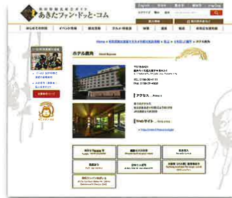
*The images are for illustration purposes.